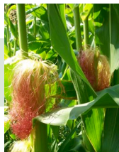
Our Famous No-Spray Sweet Corn

Fall Acorn Squash, Assorted Greens, Basil, Bok Choi, Broccoli, Broccoli Raab, Brussels Sprouts, Butternut Squash, Cabbage, Carrots, Cauliflower, Celeriac, Celery, Cherry Tomatoes, Chinese Cabbage, Collards, Delicata Squash, Edamame, Eggplant, Heirloom Tomatoes, Kale, Kohlrabi, Leeks, Lettuces, Onions, Peppers, Plum Tomatoes, Potatoes, Sessantina, Shell Beans, Spinach, Sugar Pumpkins, Sweet Corn, Sweet Dumpling Squash, Sweet Potatoes, Swiss Chard, Turnips, Zucchini